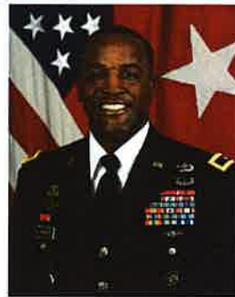
★ Commander BG Gavin A. Lawrence, USA